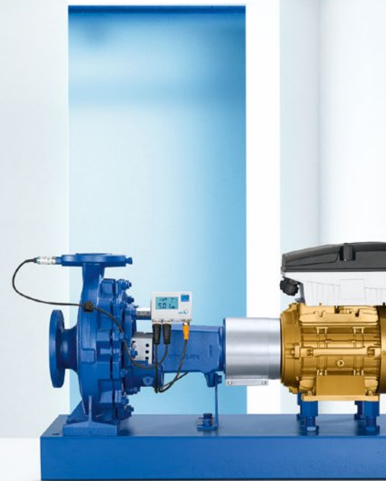
A product of perfect partnering: Etanorm

“My parents and grandparents worked for KSB, and I was determined to follow them. One great thing I find is that despite all its global activities, the company has kept a family atmosphere.”