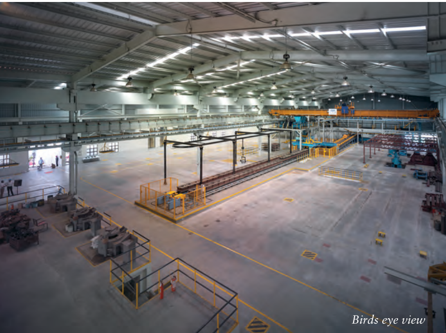
Birds eye view

6th April, 2013 - Cast Iron foundry in a new look