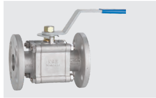
Two piece ball Valves flanged connection Three piece ball Valves threaded connection Three piece ball Valves flanged connection