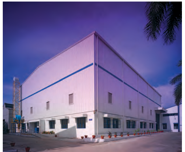
Shed from outside