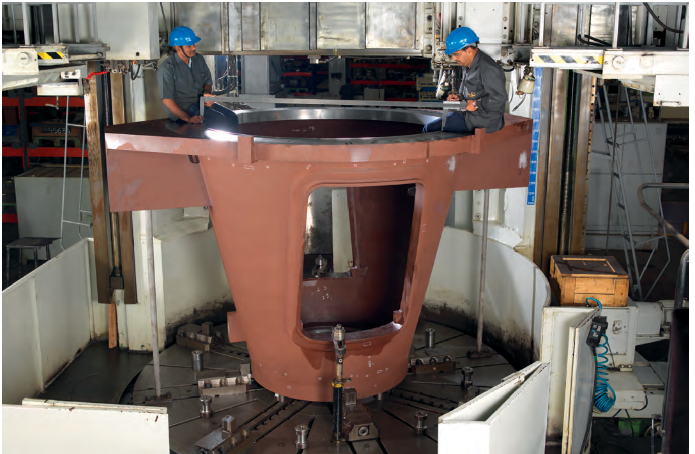
Machining of a giant motor stool of RSR pumps at Chinchwad works.

In April 2013, hot water testing for the Shut Down Cooling Pumps RVR 200-480 was successfully completed for 100 hrs. at Chinchwad works.