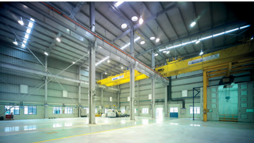
Inside view of shed with testing facilities and paint booth

18th September, 2013 - Painting & testing facilities for "Aakash" range of valves