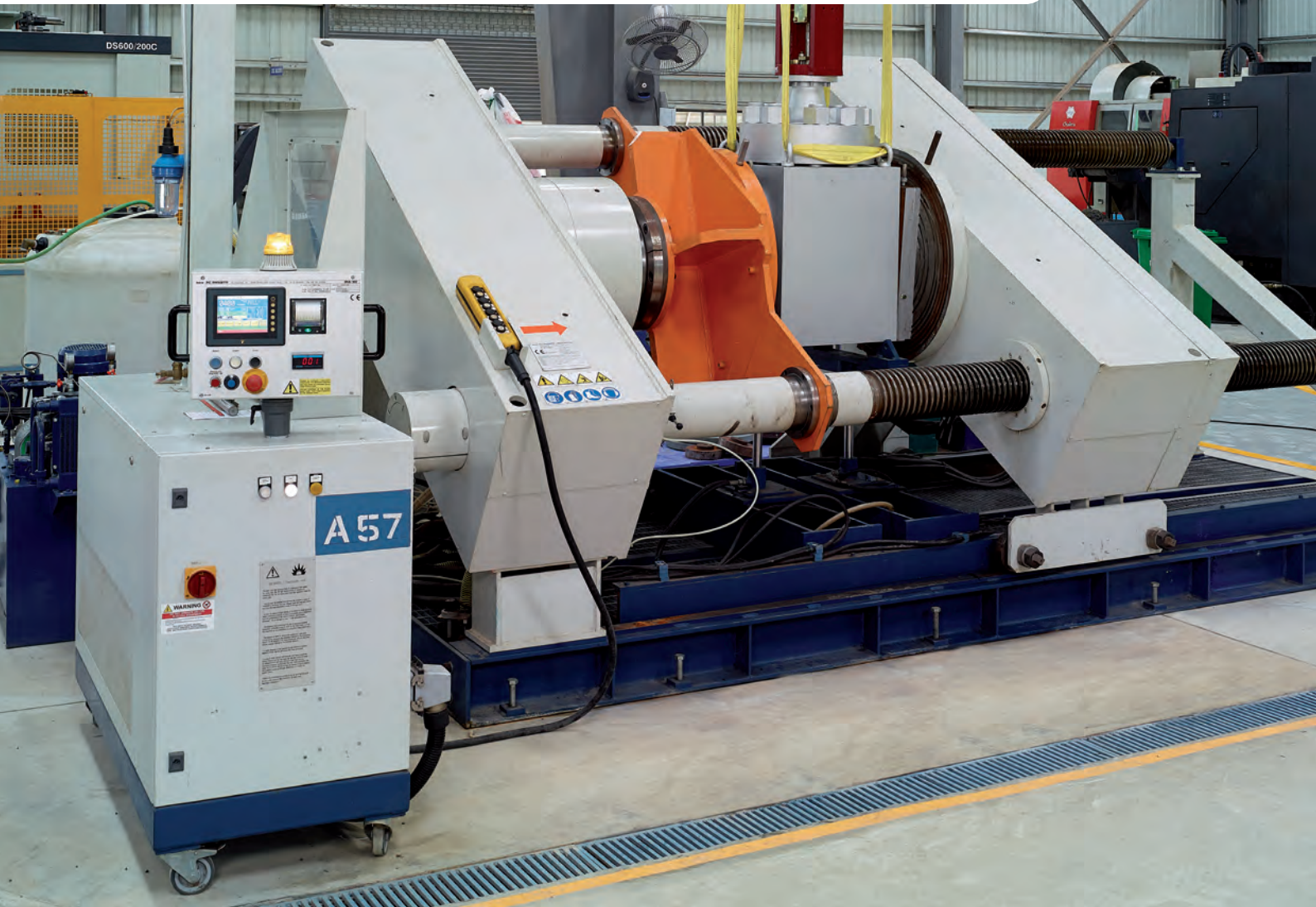
High pressure test bench for testing large size valves

Our manufacturing sites, sales and a proficient after-sales team with prompt assistance from the service centres has been oiling the alliances for a smooth operation. Markets are close, requirements are time bound and opportunities are immense. But in order to tap all these we need to act at the right time, in the right way with the right patronage. MIL is here, close to you, to speak your mind.