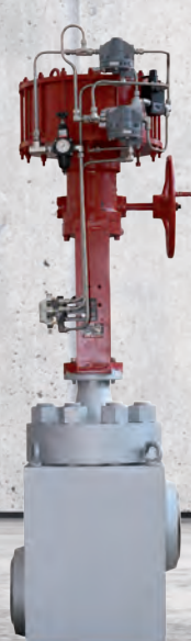
Super Heater Spray Control valve MIL 91000, 6" , 2500# ASME for 660 MW Supercritical Thermal Power Station, Maharashtra