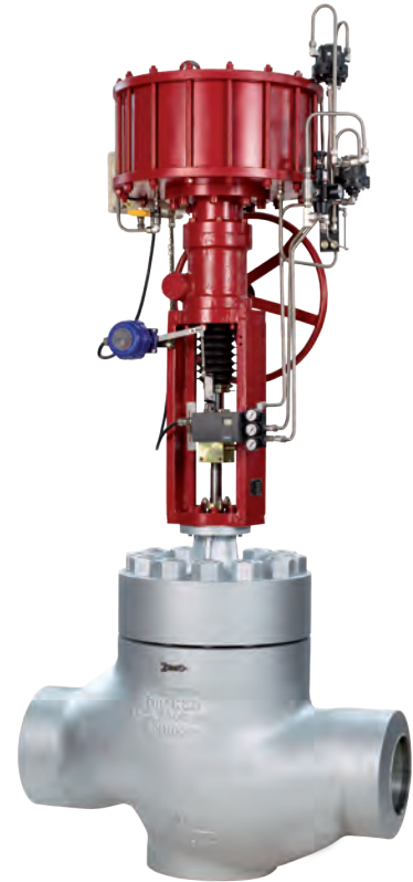
Start-up Feed Control valve MIL 91000 14" , 3000# ASME for 660 MW Supercritical Thermal Power station, Bihar

MIL's credentials have proved that its control valves can deliver high performances at both captive power plants and utility power plants including supercritical units from 660 MW to 1000 MW. MIL can cater to the most demanding design challenges and applications, thereby powering the power generation industry.