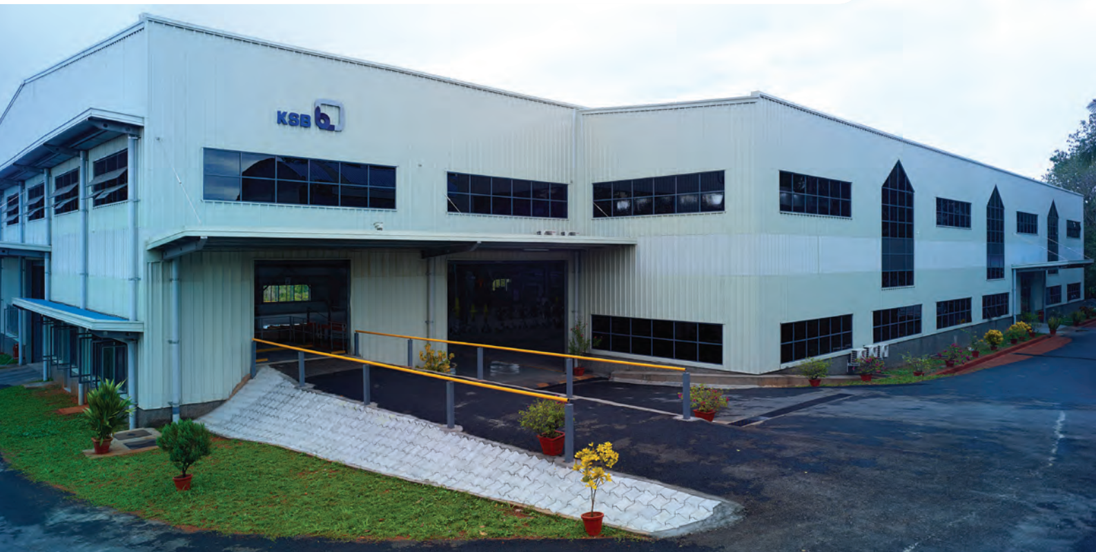
Exterior view of large valve manufacturing plant, near Kochi Kerala (India)

industries in India and abroad. With a large installed base of more than two hundred thousand control valves, MIL has a marked presence in the nation's power stations, oil refining (upstream & downstream), petrochemical and fertilizer plants and believes in, "Understanding customer needs, offering optimum solutions and after sales service, at affordable cost, on time."