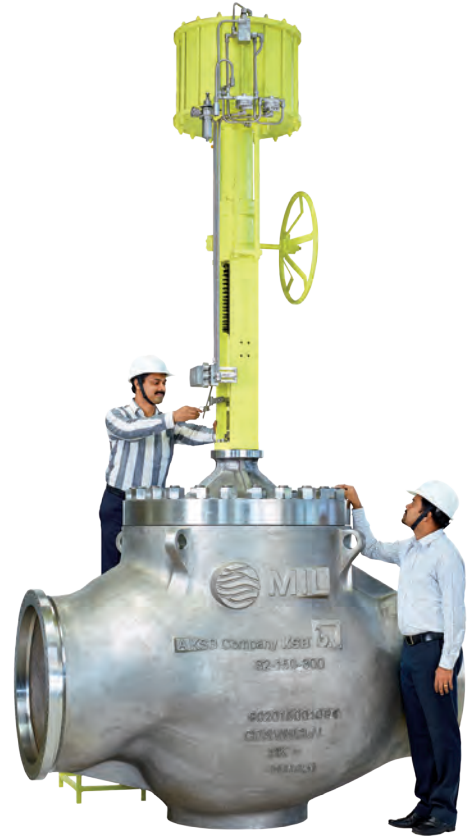
Seawater Service Control valve MIL 41000, 32", 300# ASME Super Duplex for Al Jubail, KSA

Control valves have become key components in offshore and onshore oil & gas industry, both upstream and downstream where applications are demanding due to the high pressure and adverse corrosive conditions experienced on production platforms and refineries. The indelible imprint of MIL quality has made its mark in the Indian fertilizer industry as well, with Ammonia, Urea let down valves and low noise valves for steam applications that are being used at renowned facilities. We have the proud distinction of being associated with the supply of Cryogenic control valves including Bellows sealed & Vacuum jacketed valves for Cryogenic test facilities.