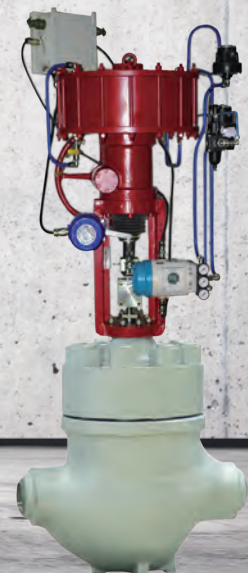
Soot Blower Pressure Reduction Control valve MIL 91000, 4 3100# ASME, for 800 MW Supercritical Thermal Power Station, Andhra Pradesh