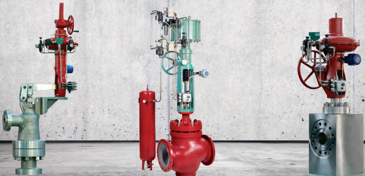
Hot High Pressure Separator Level Control valve MIL 77000, 4" x 6", 1500# ASME for Refinery complex, Uttar Pradesh