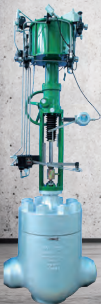
BFP Min. Recirculation Control valve MIL 91000 8" , 3000# ASME for 660 MW Supercritical Thermal Power Station, Madhya Pradesh